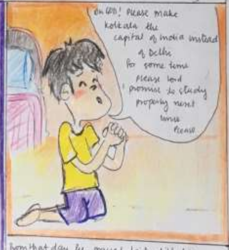
from that day he prayed daily till his report card day

PS: I hope you all "THE BEST FOR YOUR EXAMS" and pray you don't end up like Karan or else you will end up praying for the wrong thing 😊