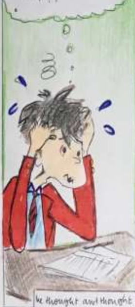
He thought and thought

Q. What is the capital of India? → ????.???