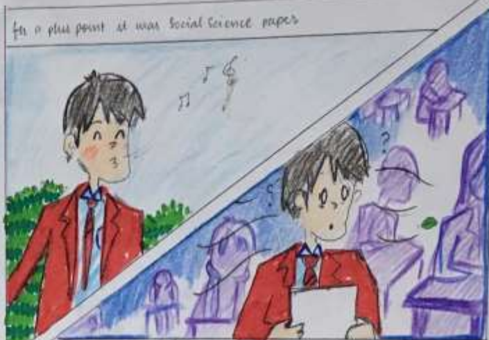
But as soon as he saw the paper